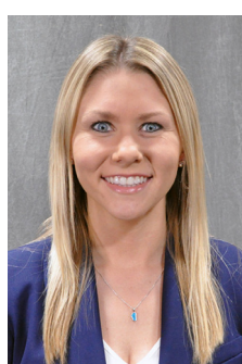
Associate Head Coach 1st Season Green Mountain '99