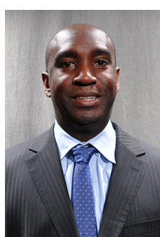
Head Coach 1st Season Cal Poly State '90